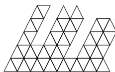
Figure 1.2: A baryiamond.

from left to right. A level in a baryiamond is a pair of adjacent columns with the same height. We distinguish between different types of levels by considering the top cells of the columns. More precisely, a ij -level in a baryiamond is a pair of two adjacent columns AB with the same height k such that the line y = k intersects the A by i cells and B by j cells. For instance, Figure 1.2 presents a baryiamond that has two levels, namely, 11-level (see the third and fourth columns) and 21-level (see the sixth and seventh columns). The perimeter of a polyiamond is the total number of its boundary edges. For instance, Figure 1.2 presents a baryiamond with perimeter 36.